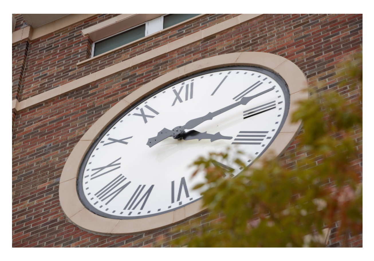
Student Return to Campus Guide Winter 2021